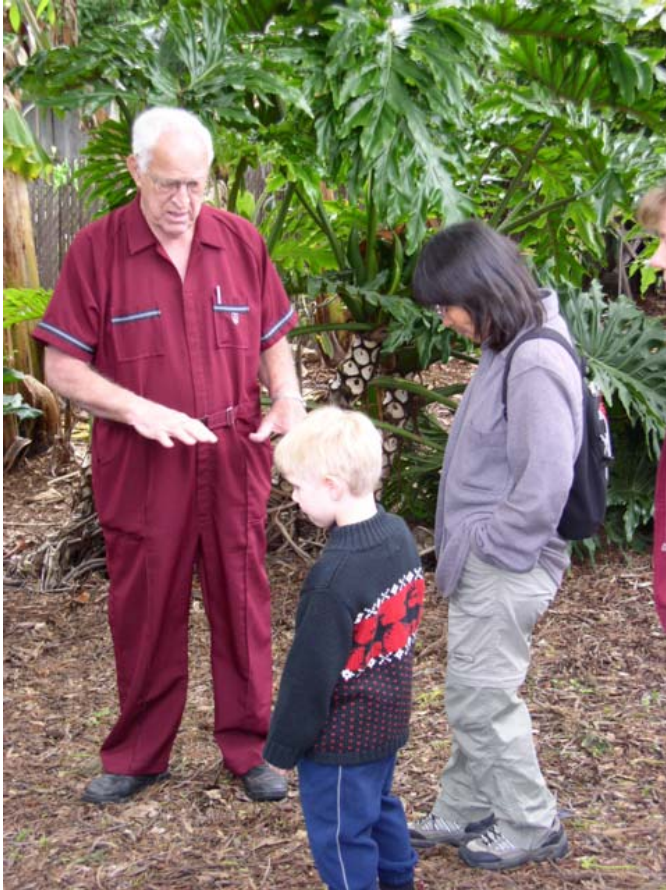
More advice for the younger generation