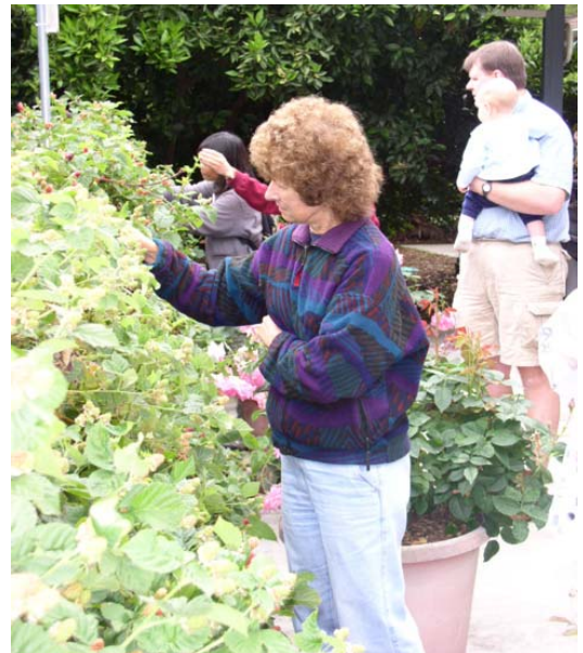
Snacking on ollalieberries