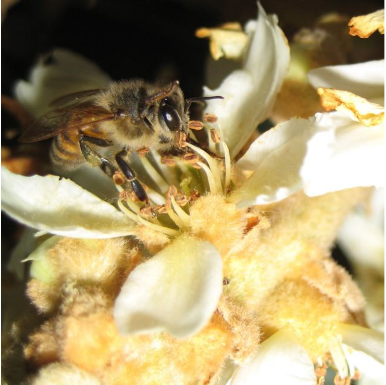
Above: Honeybee on flowering loquat, editor's garden