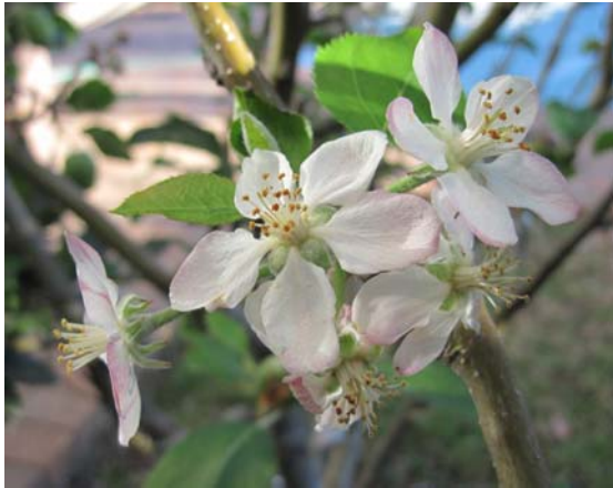
Left: "Mutsu" apple blossoms, from a graft on one apple tree with 12 different apples. The early Annas are almost ready to pick, while others are flowering now to allow harvesting of apples through the fall.