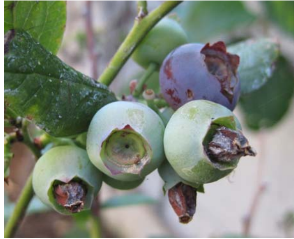
Above: "Misty" Blueberry. First year in the pot, but still a decent crop.

CRFG, and also make it much easier for us to keep our distribution list up-to-date. We have it set for strict privacy settings and you have to accept the invitation to join the group. The group is not publicly visible, and you cannot see each other's addresses. You can, however, send out an email to the entire group, but emails must be approved by an administrator before being sent to everyone, to avoid irrelevant or spam postings. The address of the group is "FoothillCRFG@googlegroups.com" .